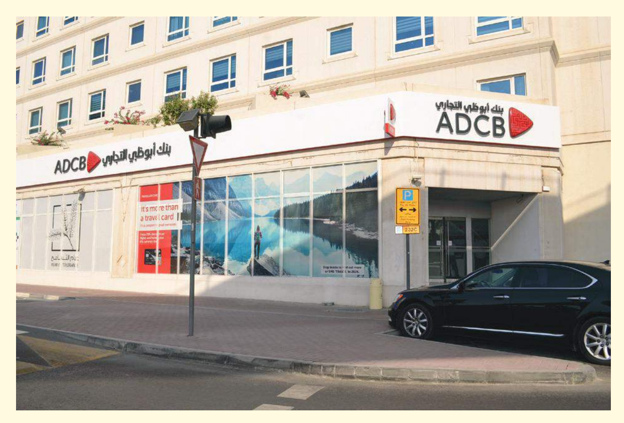
Banking made easier with one of the biggest banks in the UAE