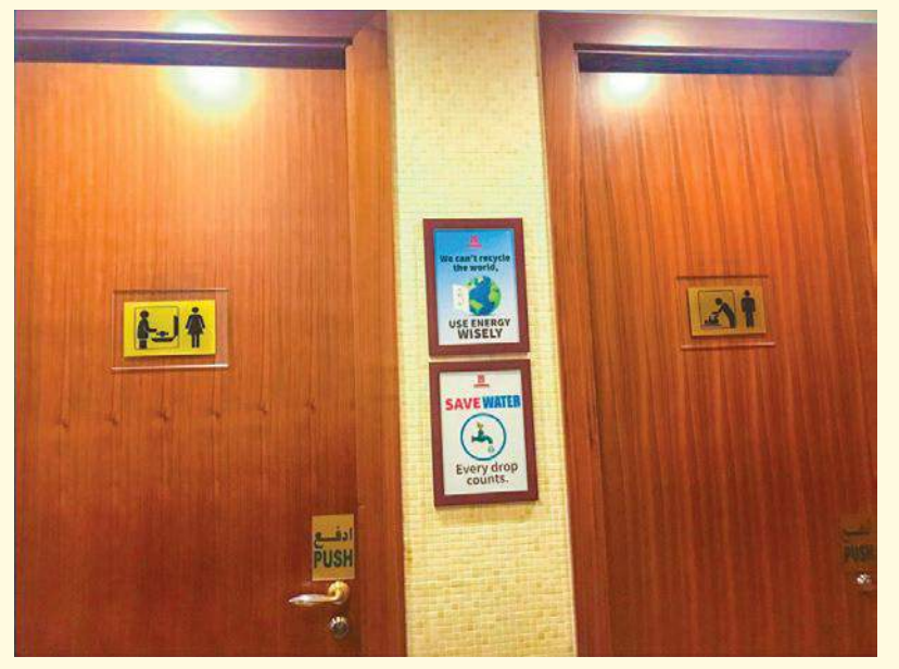
Posters on water & energy conservation are displayed in hotel's lobby washrooms, staff cafeteria & accommodation, common areas

Green initiatives, upholding the authentic heritage of the region and knowledge in supply chain sustainability were discussed to better identify critical risks to improve long-term profitability.