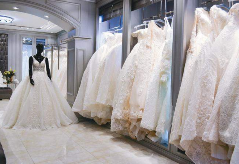
Check out the new bridal collection and designer gowns at Al Daker Shop