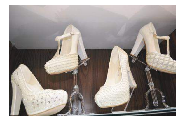
Try on the new collection of dazzling shoes only at Smile View