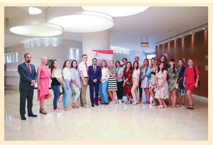
Fam Trip Anex Tour – Novosibirsk, Russia