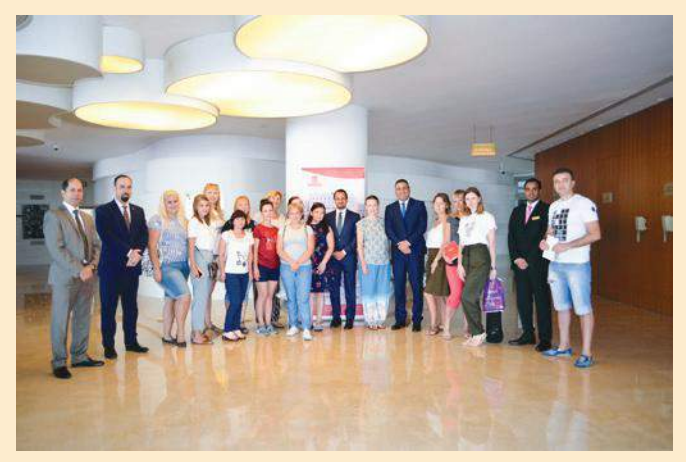
Fam Trip Anex Tour – Nizhny Novgorod, Russia