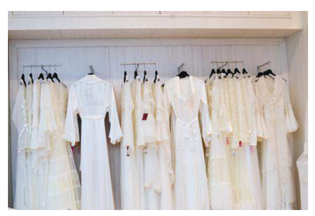
Variety of selections and styles available at 2nd Skin