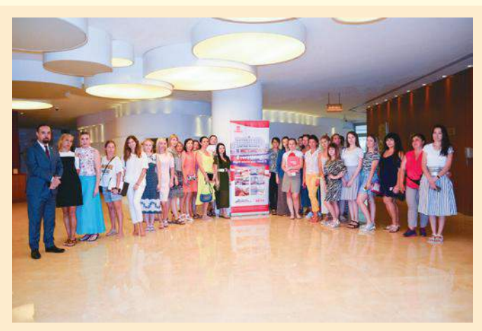
Fam Trip Anex Tour – Irkutsk, Russia